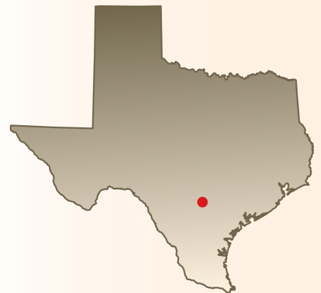
San Antonio, Texas Average Weather Statistics