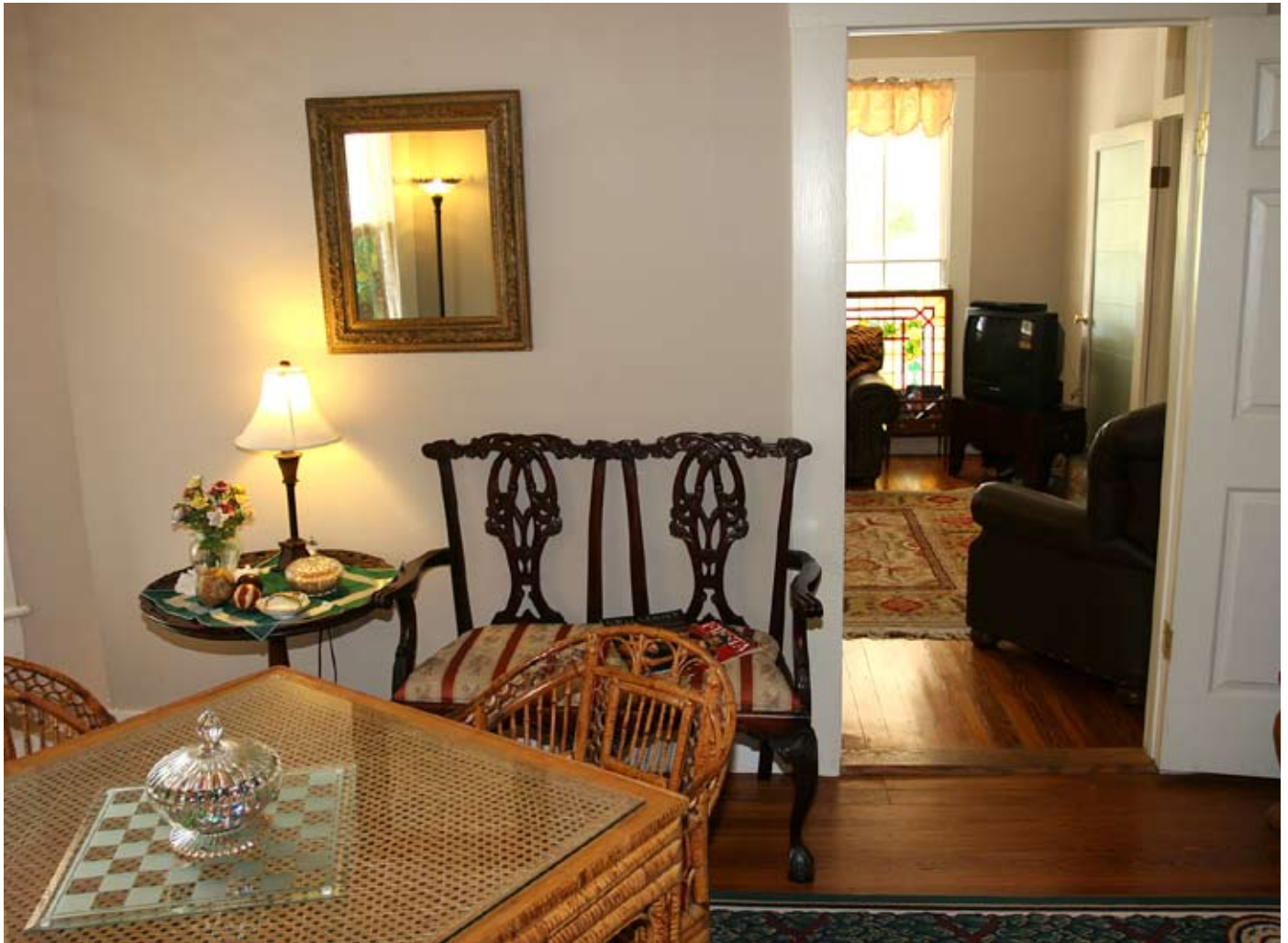
Above: The Library and Game Room. Below: The Texas Rose room.