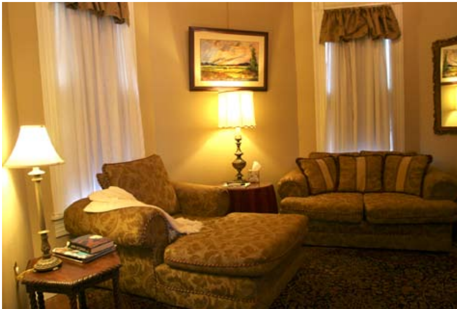
The sitting room in the Grand Victorian Suite.