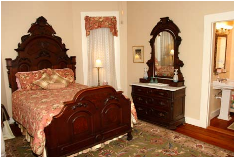
The beautifully appointed Garden Retreat room.