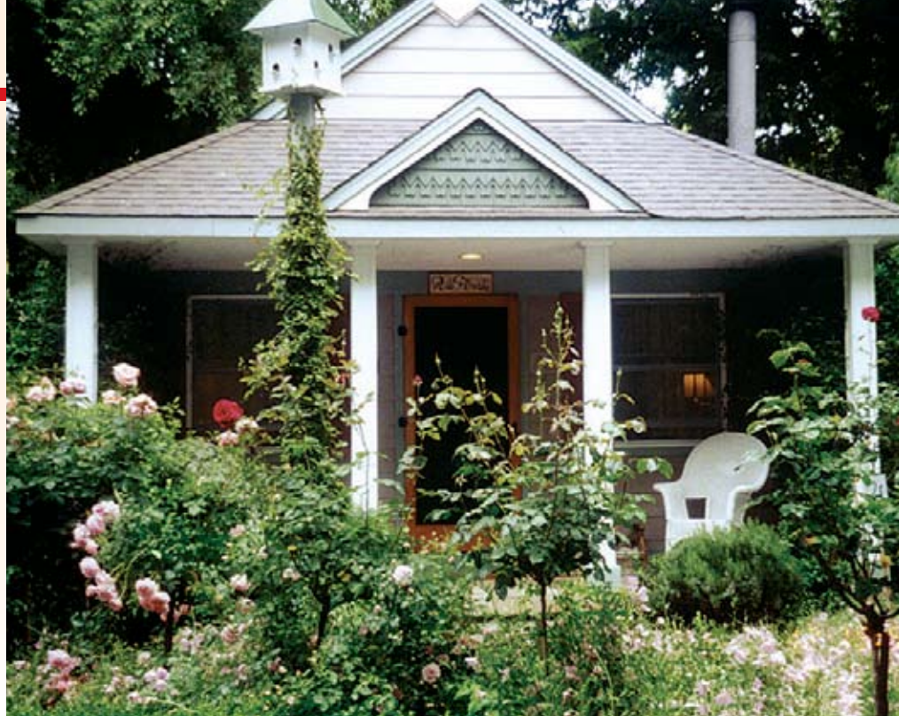
▲ One of 16 quaint, private cottages available at the Cottage Grove Inn.

Fly into San Francisco and drive 80 miles north to Calistoga. A trip you soon won't forget.