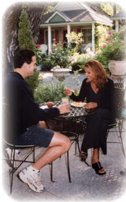
Enjoying breakfast alfresco!

If the inside of the Rose Floral cottage was to be anything like the outside, we were in for a great stay. In front of our cottage was its own garden – flowers everywhere! (And it was mid-March!) On the covered porch we were greeted by two